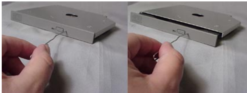
Figure 2.Using Emergency Eject